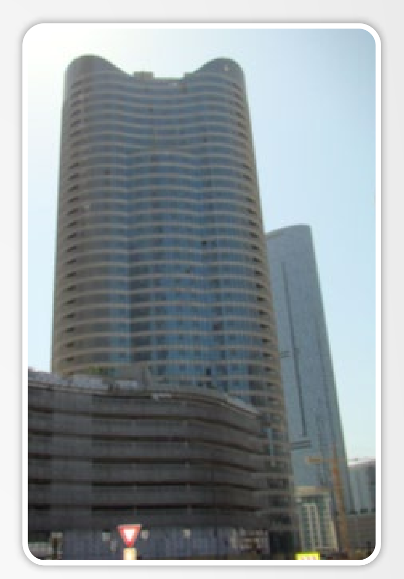
Sigma 1 Façade work