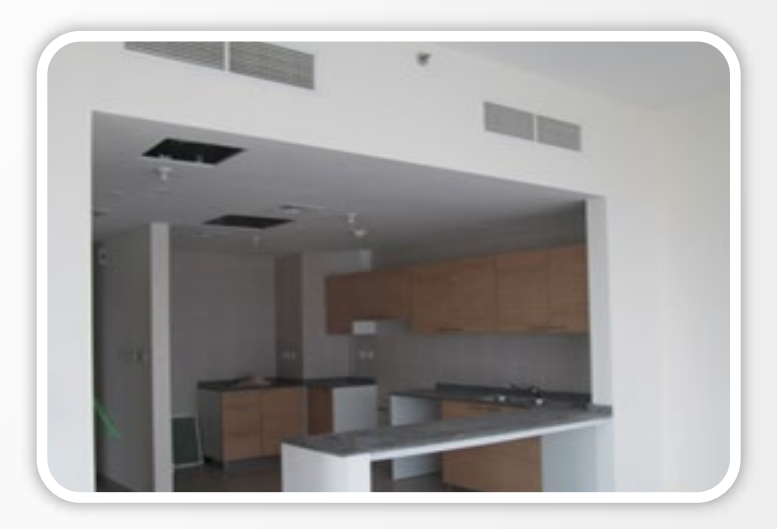
Kitchen at Sigma1 (Mock up unit)

Ground level paving and Canopy installation at Sigma 1