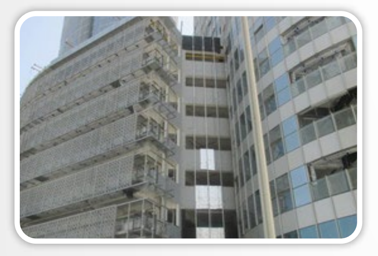
ACP cladding works at Podium Level Façade