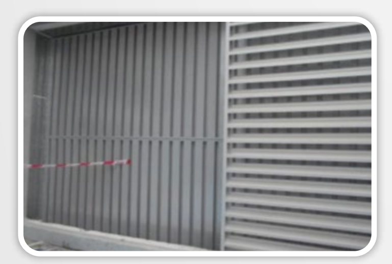
Sand trap louver at Sigma 2

Pressure reducing station (SNG system) at Sigma 2