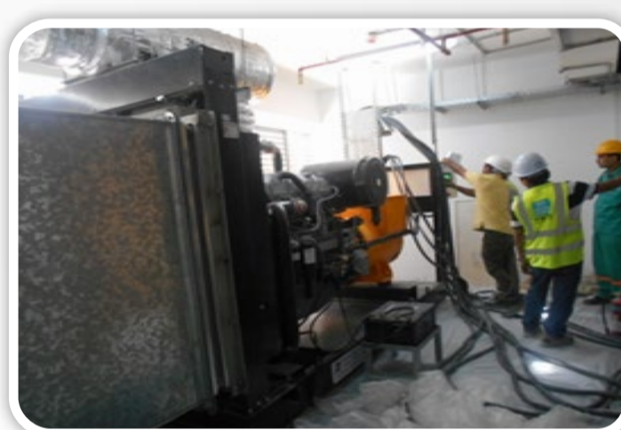
Ground floor Generator testing