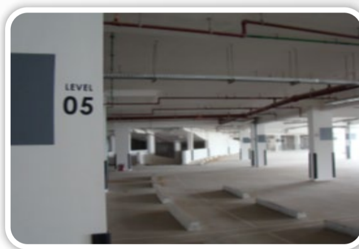
Car park marking & signs at the podium