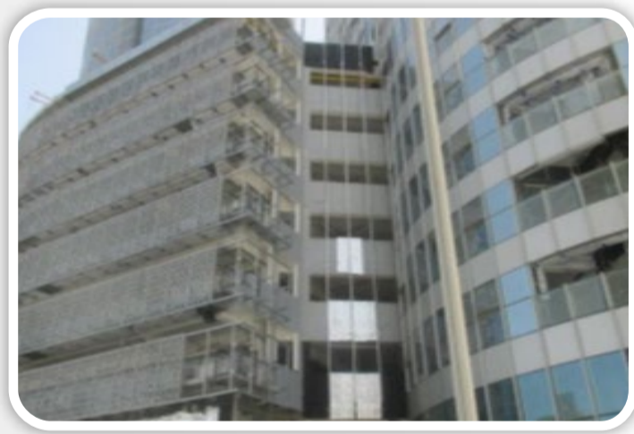
Aluminum Cladding Panels (ACP) works at Podium Level Façade