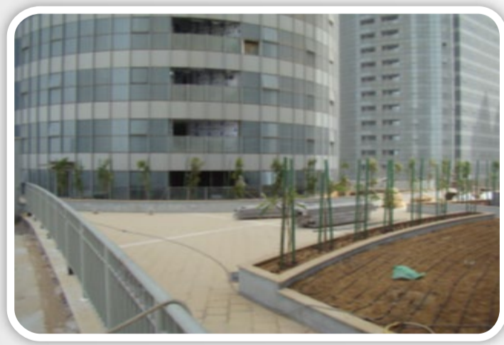
Podium Level 8 Landscape & Plants