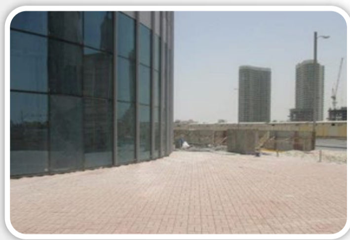
Paving Tiles fixing works at Ground Level