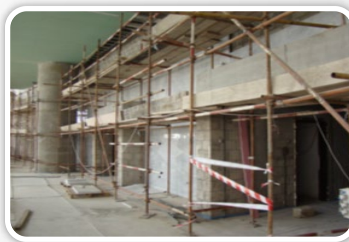
Marble cladding works in the Main entrance