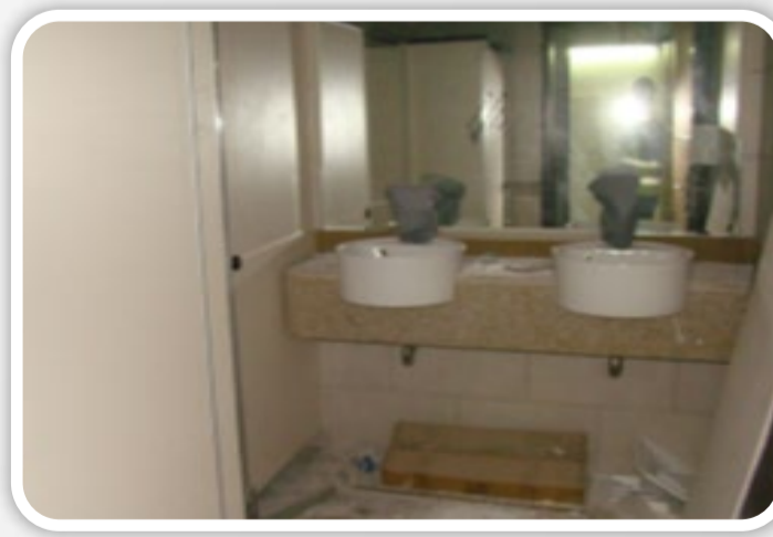
Toilet sanitary wares

We hope this project update has been informative; there are many activities taking place within the Project and we will share more details with you in our next update which is due for release in early October 2015. In the meantime, we welcome your comments and your continued support for this project. Please feel free to visit our offices or contact us via any of the methods shown below.