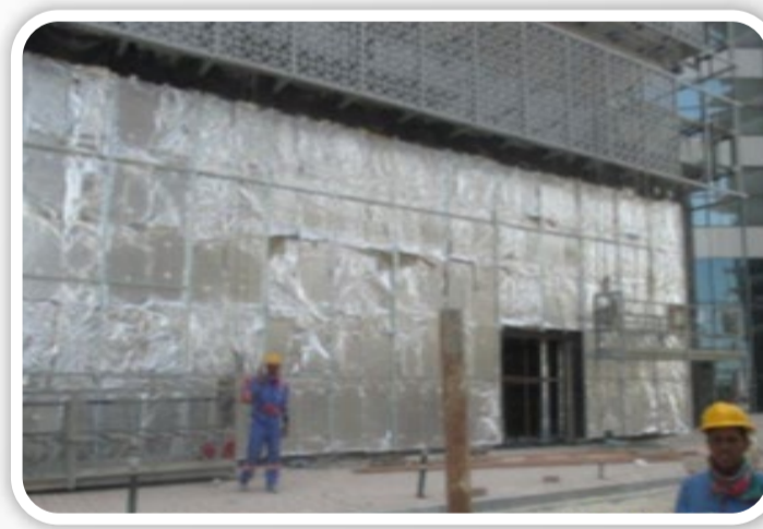
Mashrabia panel & (ACP) installation podium levels