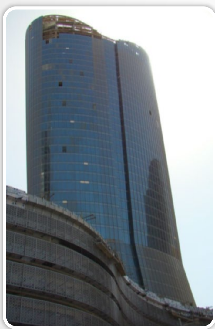
Façade works Omega Tower