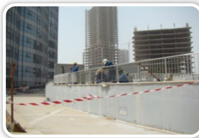
Podium Level swimming pool railing works